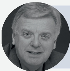
Lord Michael Grade Chair of Fundraising Regulator